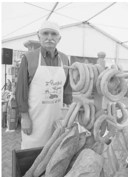
A baker poses next to breads and koulouris (bread rings) at a bread festival in Thessaloniki, Greece.

The street-food business in Greece is dominated by men. Women play a minor role, largely because regulations forbid the distribution of home-prepared food by street vendors. The only cooking technique allowed on the street is barbecuing (a traditional male occupation). The ingredients are supplied from commercial companies. Thus, all the koulouria in Athens are supplied by three or four specialized bakeries, five factories supply pita bread to all parts of Greece, while special butcher shops prepare.